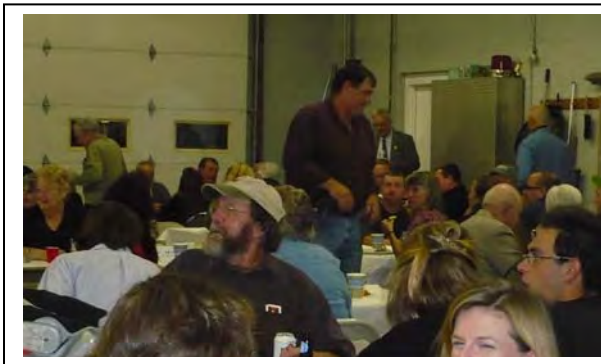
RI Raised Livestock Association Annual Dinner November, 2010. This year's supper event was held at Smithfield Elks Club. Over 150 farmers, family and guests attended.