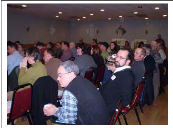
RI Raised Livestock Annual Meeting – 100 persons in attendance at West Greenwich Elks Club. Membership is now 120 members with 35 members actively selling meat products (beef, pork, lamb, chicken, turkey, and value added meat products) at Farmers Markets statewide, from on-farm sales, and wholesale to restaurants and hotels in RI.