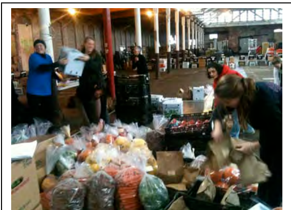
FFRI Market Mobile – sorting process

Farm Fresh Rhode Island is excited to announce, with this Thursday's delivery of fresh, local food from its Pawtucket warehouse to local chefs, grocers and institutions, that its Market Mobile wholesale program will reach $1,000,000 in sales after starting up in 2009.