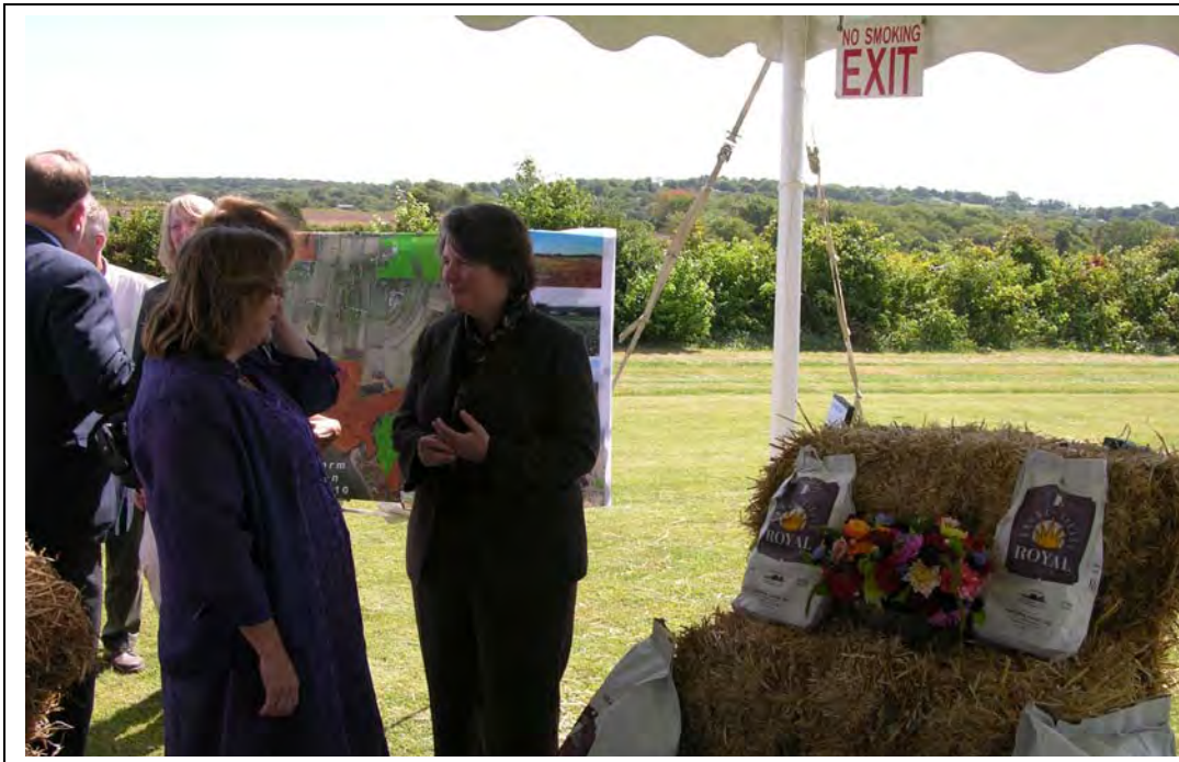
RI Royal Potato Growers Association campaign posters for retail stores (shown above and top right) and, USDA-RD members at Feroilbink Farm, Tiverton, RI for introduction of new RI Royal bags.