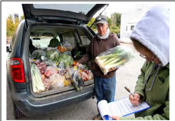
Arrival of produce from Skip Paul Farm, Tiverton, RI to Market Mobile. Logging in is Farm Fresh RI Representative.

The program has experienced phenomenal growth in its two short year as a result of increasing demand for fresh, quality food that only local farms can provide. Winter isn't usually considered the growing season here in New England, but Market Mobile sales are already up 83% in 2011, after growing 200% last year. Even in the darkest days of winter, with snow covering the farms, weekly winter sales are only 40% off of a September 2010 record. 2011 sales are on track to top $1 million, on target for Farm Fresh's goal of $2.5 million by 2014.