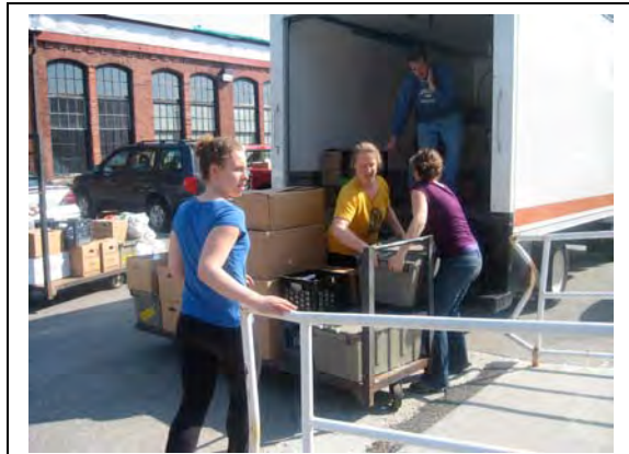
Farm Fresh Rhode Island – weekly distribution activity to institutions.

Farmers have dramatically increased winter (and summer) production by adding new year-round greenhouses and storage facilities and expanding acreage to respond to customers' demand. Farmers are selling a bounty of greenhouse greens, sweet potatoes, apples, herbs, eggs, meat, milk and cheese. Participating producers include Aquidneck Farms (Portsmouth), Baffoni Poultry Farm (Johnston), Blue Skys Farm (Cranston), Narragansett Creamery (Providence), NorthStar Farm (Westport), Schartner Farms (Exeter) and Rhody Fresh (nine farm locations).