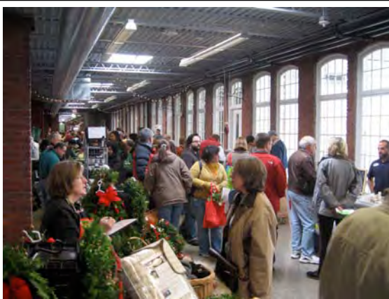
Farm Fresh RI – Crowds of customers at the Indoor Winter Farmers Market. Wed evenings and Saturdays.

Farm Fresh continues to respond to the growth of supply of and demand for local food in Rhode Island. Seasonal, neighborhood market opportunities showed a strong season for over 60 local food vendors, including farmers, nurseries, bakeries, and prepared food sellers. These are small businesses that benefit from the low-capital opportunities presented by neighborhood farmers markets.